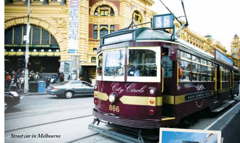
Street car in Melbourne

"We cruised along the south of Australia, stopping in Adelaide and Port Lincoln, where I joined one of the most memorable shore excursions I've ever done."