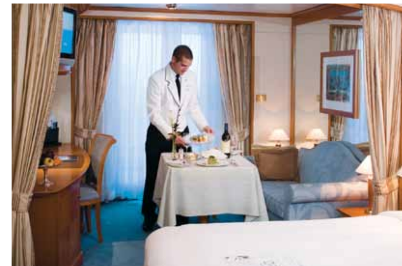
FROM TOP: The Rocks, birthplace of Sydney; personalized butler service on board Silver Shadow ; the famous Port Arthur Historic Site in Tasmania.