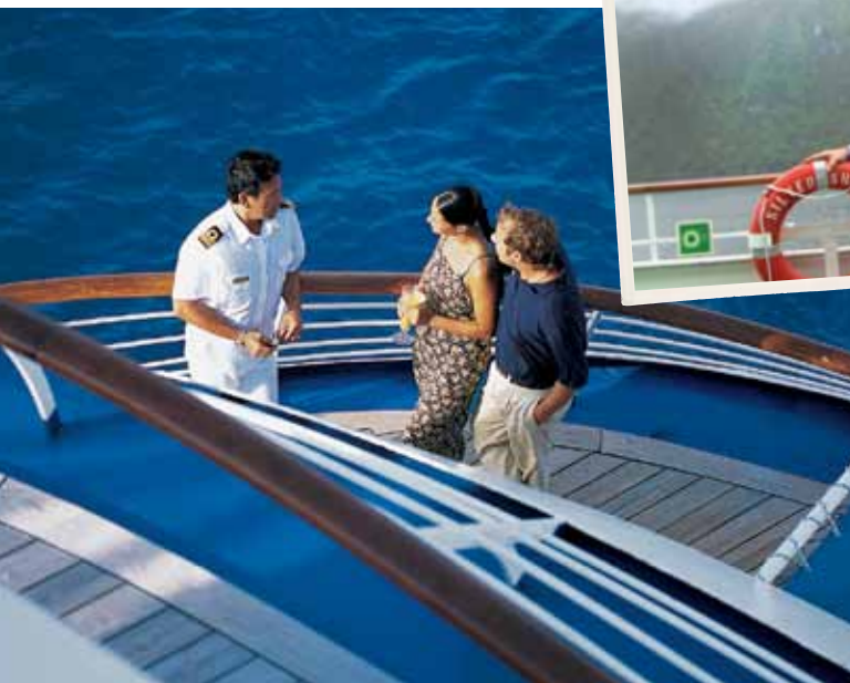
FROM TOP: Marvel at the beautiful Milford Sound in New Zealand; with fewer than 400 guests, it's easy to get to know the staff and fellow guests on board Silver Shadow ; the spectacular Auckland skyline.